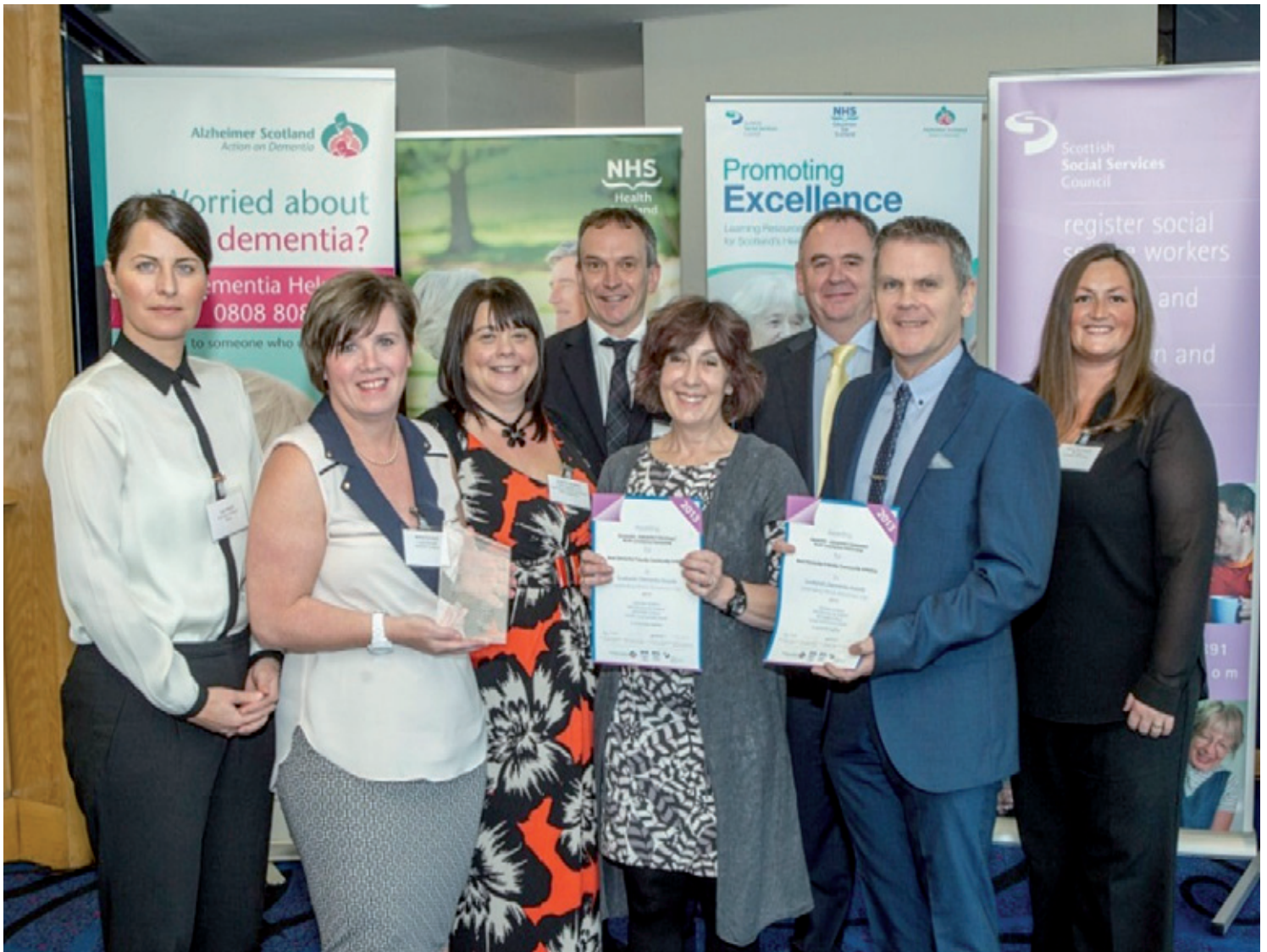
Collecting award at Scotland's Dementia Awards ceremony 2013