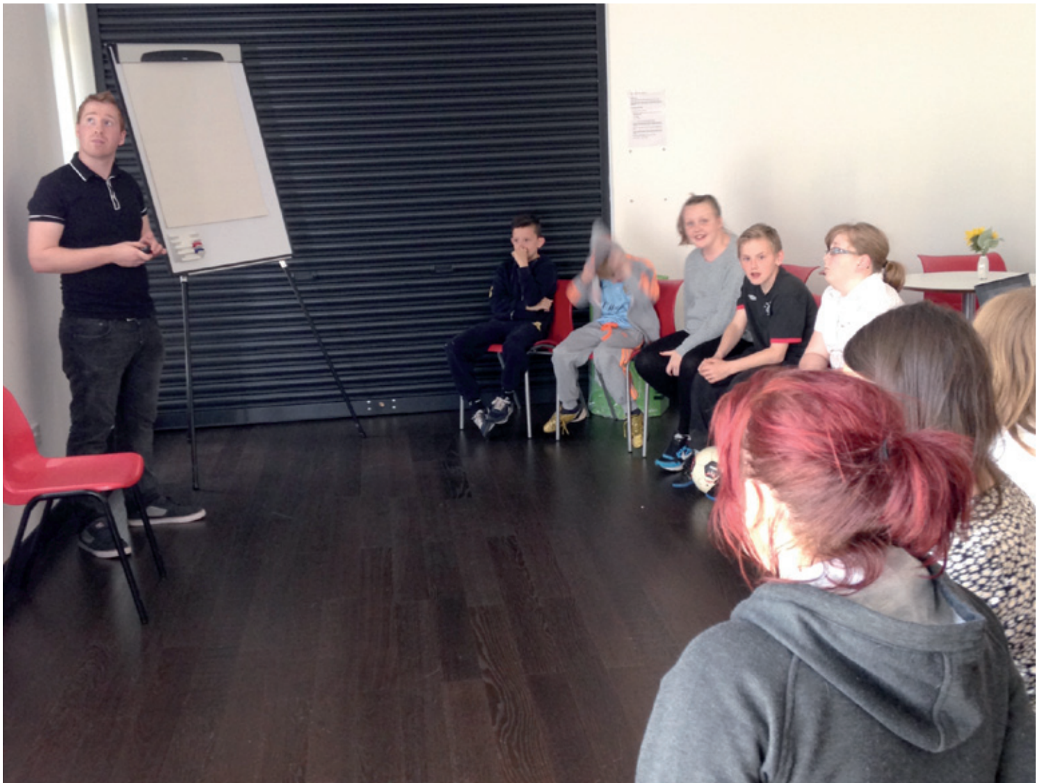
Awareness session at Centre Point Youth Group.