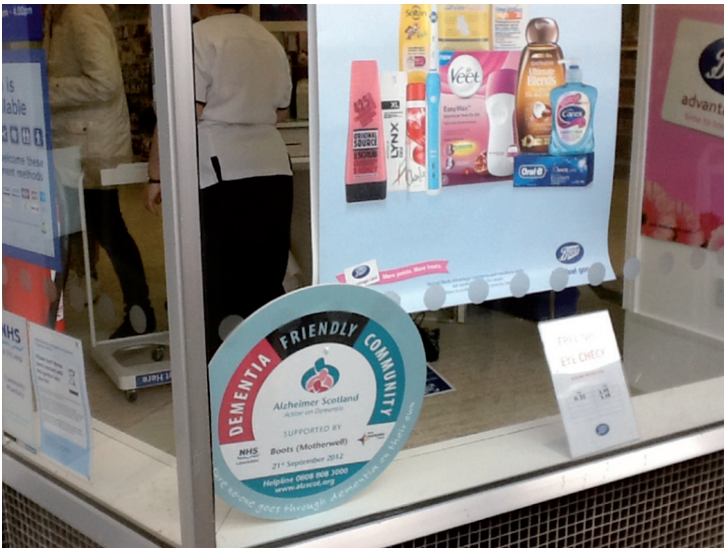
DFC logo in window of Boots, Motherwell

In delivering the programme, the pilot team created a simple methodology and tool kit. The tool kit would take the staff from the shops and businesses and the team through measured development stages towards 'dementia friendly community' status. This tool kit was refined through practical use and incorporates the following key components: