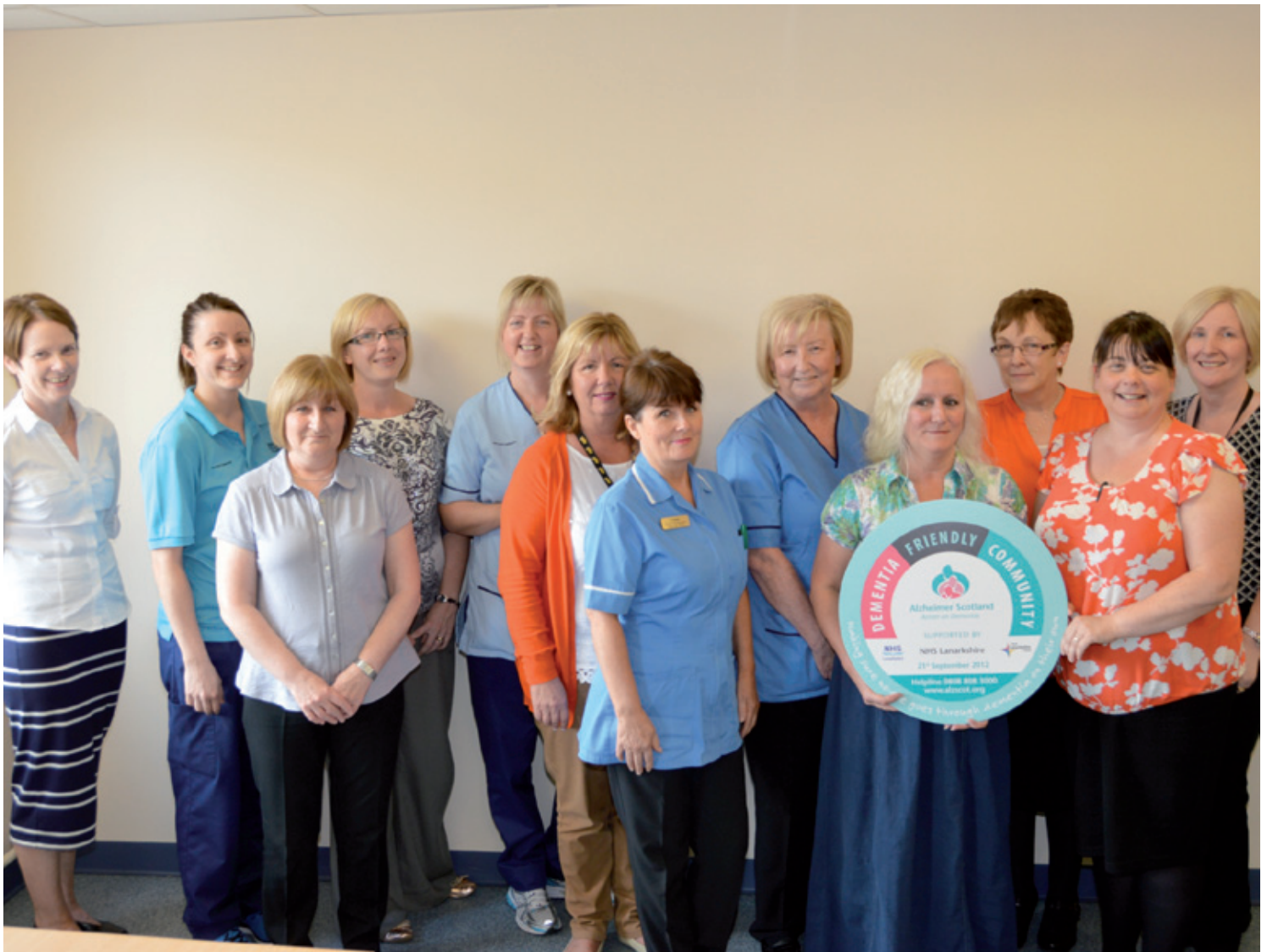
Motherwell Health Centre.