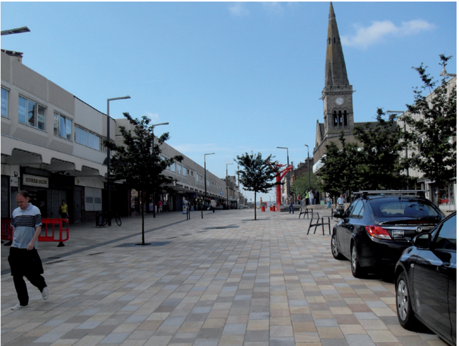
Motherwell Town Centre