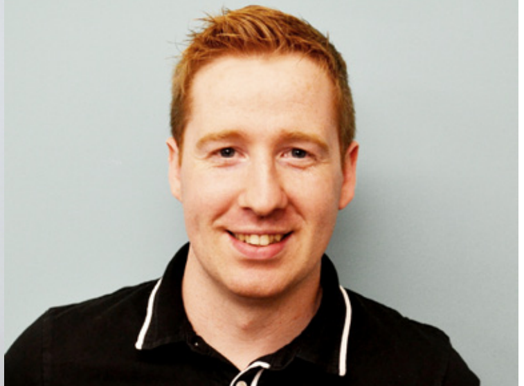
Alzheimer Scotland's new Dementia Friendly Community Team for North Lanarkshire