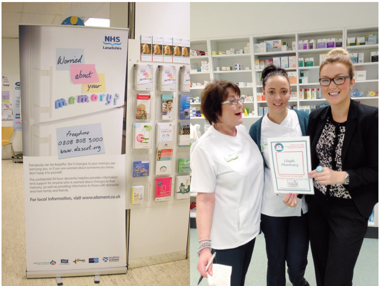
Local Boots and Lloyds pharmacies were among the first to support the initiative

We also wanted to use a brand that would have longevity and meaning outside of Motherwell as we would be sharing our work nationally as one of the three Dementia Demonstrator Sites.