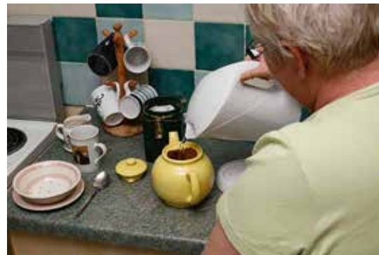
Examples of some of the assessment techniques used by the team of occupational therapists at their clinic in NHS Fife.