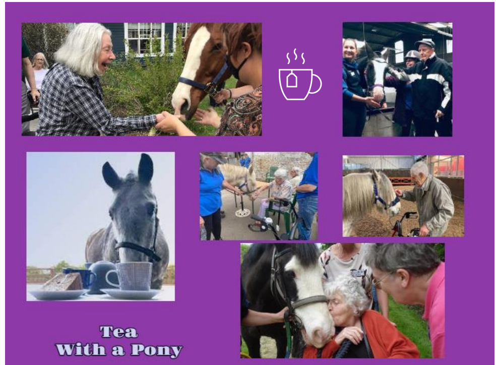
Tea With a Pony