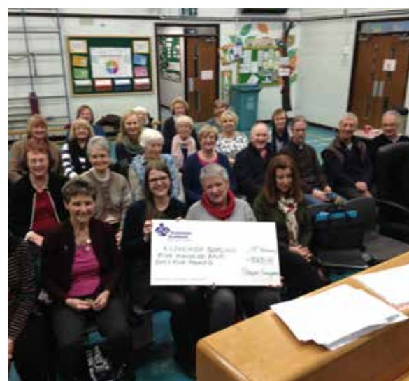
The wonderful Stepps Songsters held a music concert in aid of Alzheimer Scotland and raised a fabulous £565! They even invited our community fundraiser along to their rehearsals for a wee sing song – thanks Songsters!