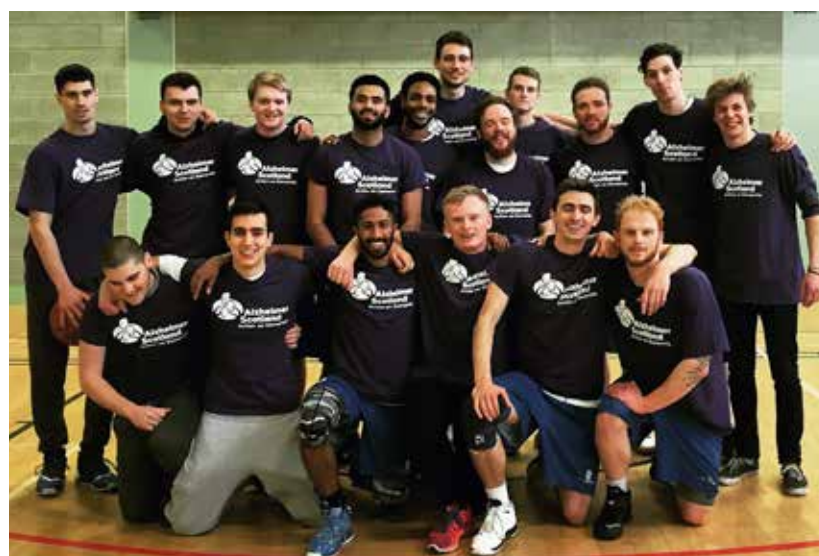
This year the wonderful Men's Basketball team at Queen Margaret University are organising a number fundraisers for Alzheimer Scotland, including a "Take Me Out" themed event. They've raised over £500 so far. Thanks chaps!