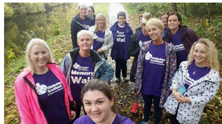
Family and friends got together to organise the 'Remember this 5k walk' in West Dunbartonshire after a beloved family member was diagnosed with dementia aged 57. They raised a fantastic £2,276!