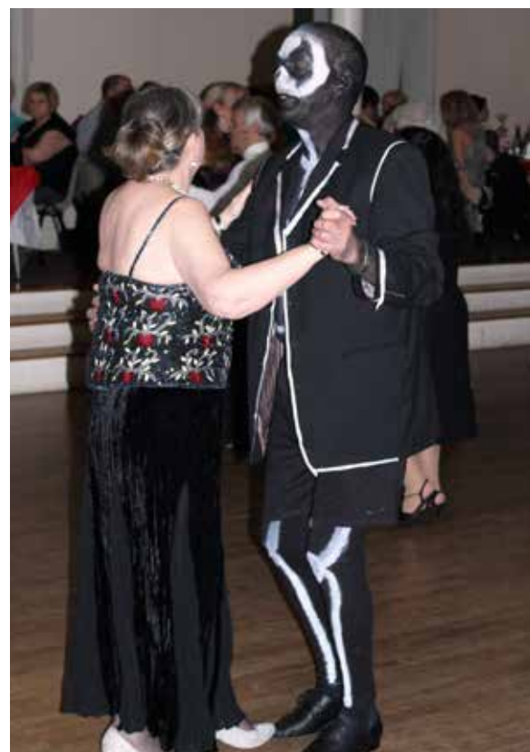
This winter, members of Shall We Dance dance classes in Renfrewshire raised over £1,700 for Alzheimer Scotland. At one of the events, 100 guests turned out for a Bond themed charity dance evening, dressed as Bond characters. Thanks to everyone who took part!

Here's a snapshot of some of the brilliant fundraising our supporters have been doing over the past few months.