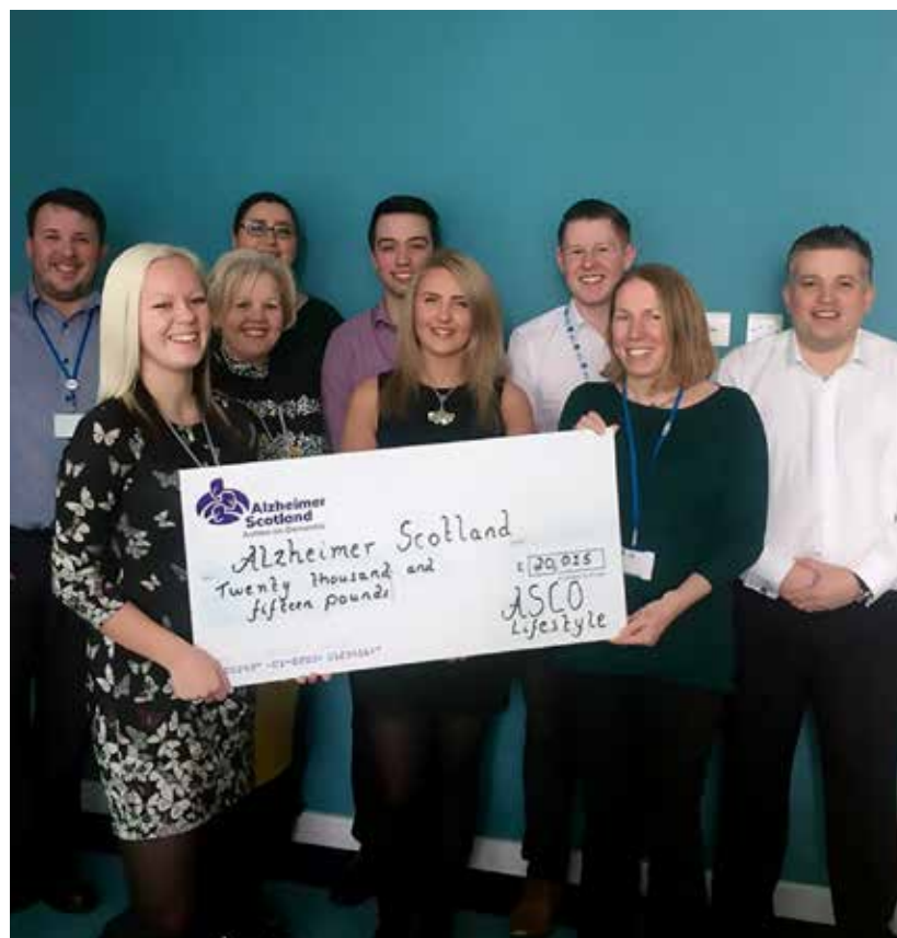
Well done and thank you to everyone at ASCO in Aberdeen, where staff have been busy fundraising for us for the last year. Organising a range of events from clairvoyancy nights to bake sales, they have done an amazing job! This February they presented us with a cheque £20,015.