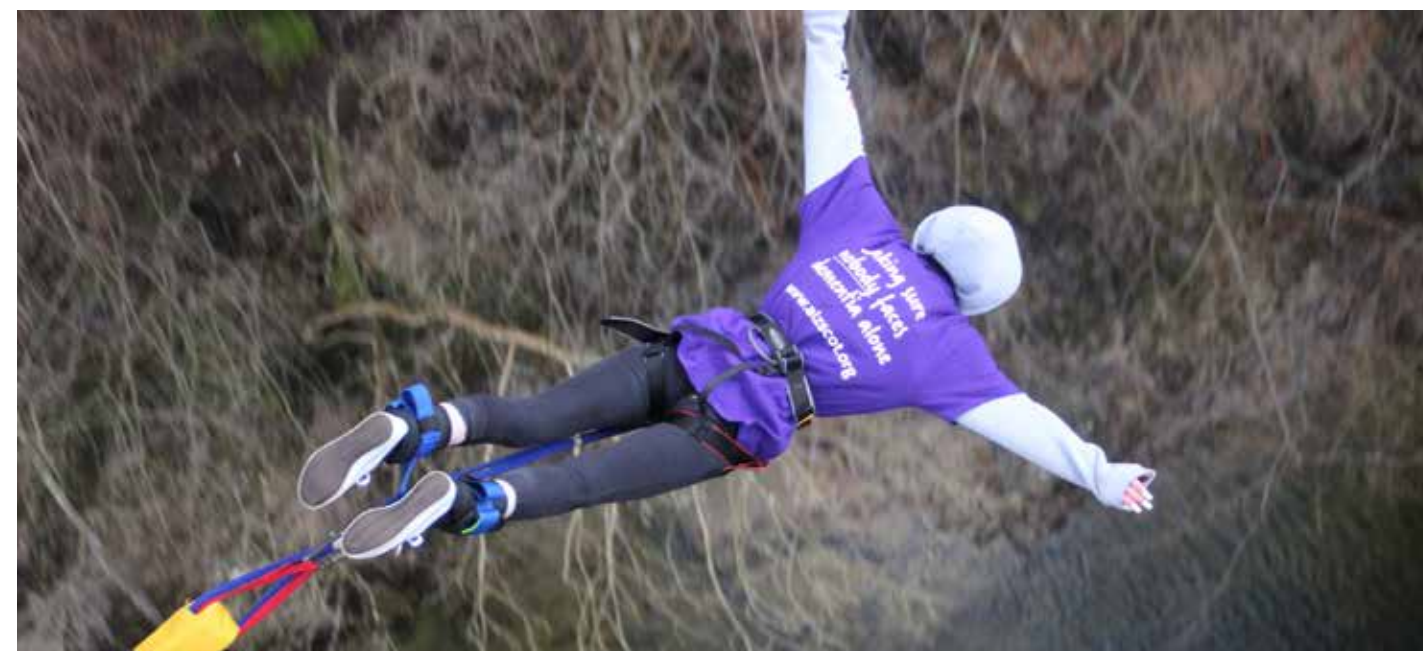
Staff and family members from Camilla House care home in Auchtertool did a bungee jump raising over £1000. Thank you!