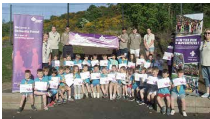
All four troops of the 32nd Scouts became Dementia Friends during DAW

into a garden party as it was so hot! I had a collection box and we raised £50 for Alzheimer Scotland. We had a lovely afternoon."