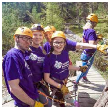
Staff, volunteers and supporters zip-sliding near Inverness to raise funds during DAW