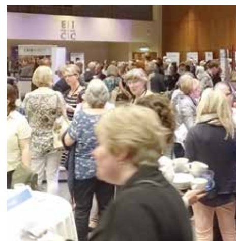
Bustling exhibition area which hosted 52 exhibitors from across Scotland