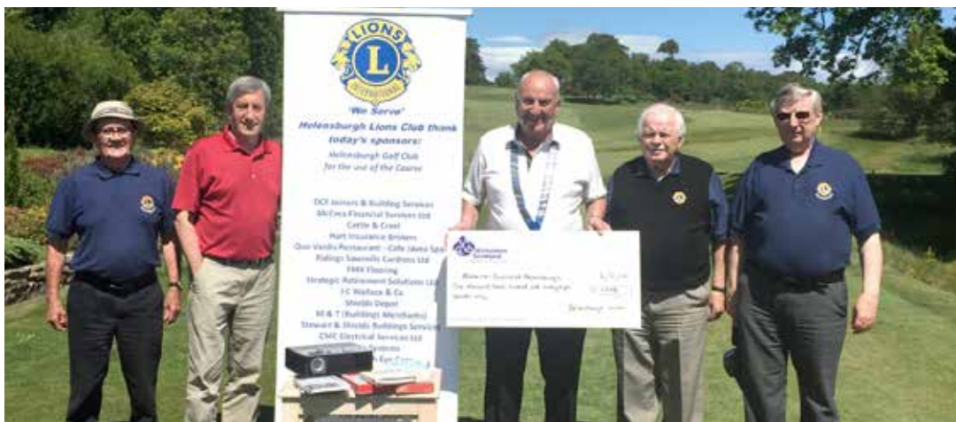
Helensburgh Lions gave a generous donation of £2000 to purchase movie equipment for the Helensburgh Dementia Resource Centre. So far visitors to the centre have enjoyed Movie Memories and watched the Wimbledon final with the new equipment.