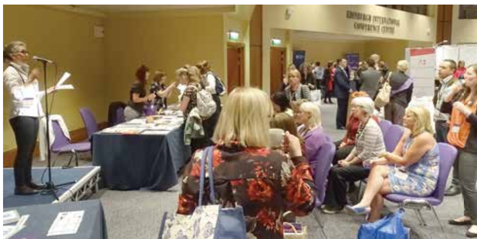
Soapbox sessions showcased innovative practice in non-pharmacological interventions