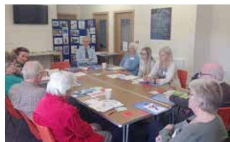
Members of the local Scottish Dementia Working Group held a Tea & Blether in the Gospel Church Hall in Perth to talk about how to involve people in their work and raise awareness of dementia