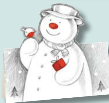
H Snowman & Robin Cut out 150 x 150 mm Pack of 10 cards - £3.80