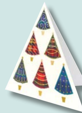
L Tartan Trees Cut out & gold foil 150 x 150 mm Pack of 10 cards - £4.25