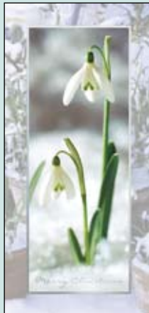
F Winter Bloom Silver foil 87 x 174 mm Pack of 10 cards - £4.70

The greeting inside these cards reads: Cards B, C, F, K, L With Best Wishes for Christmas and the New Year. Nollaig Chridheil (Gaelic for Happy Christmas) Cards A, E, G, H, I, J Season's Greetings and Best Wishes for the New Year Card D With Best Wishes for Christmas and the New Year Card M Blank for your own message