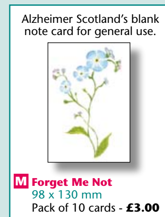
M Forget Me Not 98 x 130 mm Pack of 10 cards - £3.00

Alzheimer Scotland's blank note card for general use.