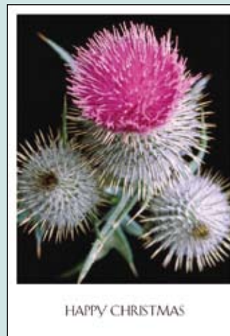
L Festive Thistle 121 x 171 mm Pack of 10 cards - £3.90

From an original by James McKillop who took up photography after his diagnosis with dementia