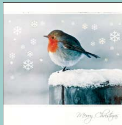
A Frosty Robin Silver foil 128 x 128 mm Pack of 10 cards - £4.20