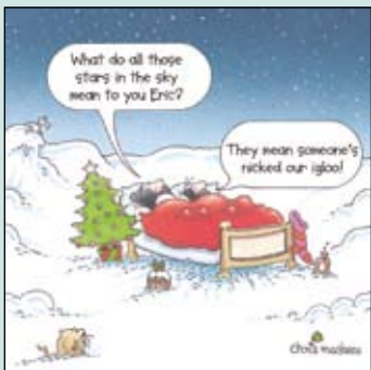
E Someone's Nicked our Igloo! 127 x 127 mm Pack of 10 cards - £3.80