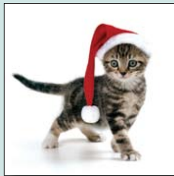
D Christmas Cat 120 x 120 mm Pack of 10 cards - £3.80