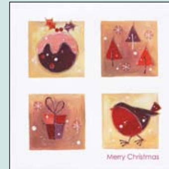
K Christmas Images 150 x 150 mm Pack of 10 cards - £4.25

The greeting inside these cards reads: Cards B, C, F, K, L With Best Wishes for Christmas and the New Year. Nollaig Chridheil (Gaelic for Happy Christmas) Cards A, E, G, H, I, J Season's Greetings and Best Wishes for the New Year Card D With Best Wishes for Christmas and the New Year Card M Blank for your own message