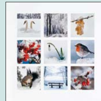
J Natures Way 150 x 150 mm Pack of 10 cards - £4.50

From an original by James McKillop who took up photography after his diagnosis with dementia