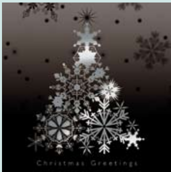
C Snowflake Tree Silver foil 127 x 127 mm Pack of 10 cards - £4.40