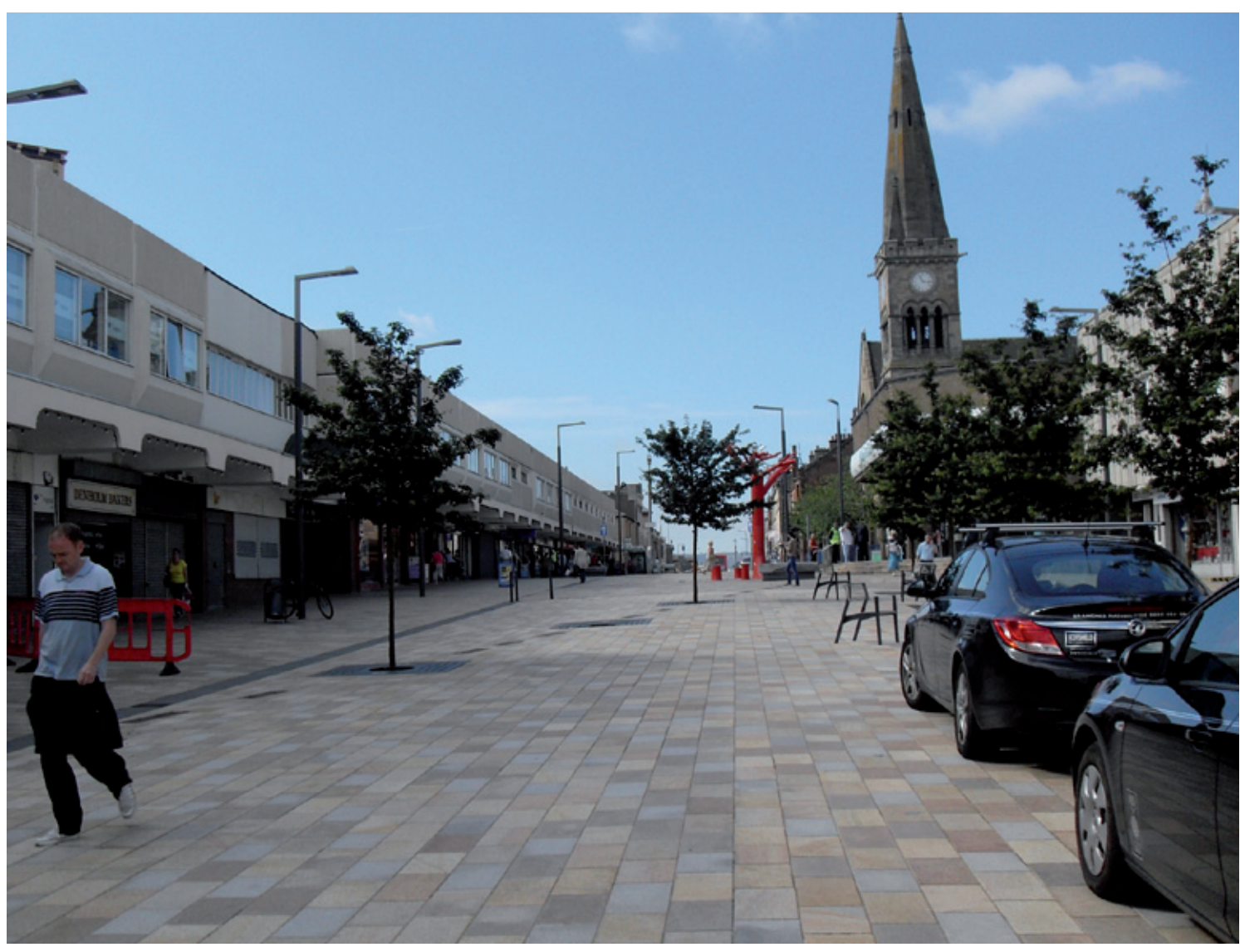
Motherwell Town Centre