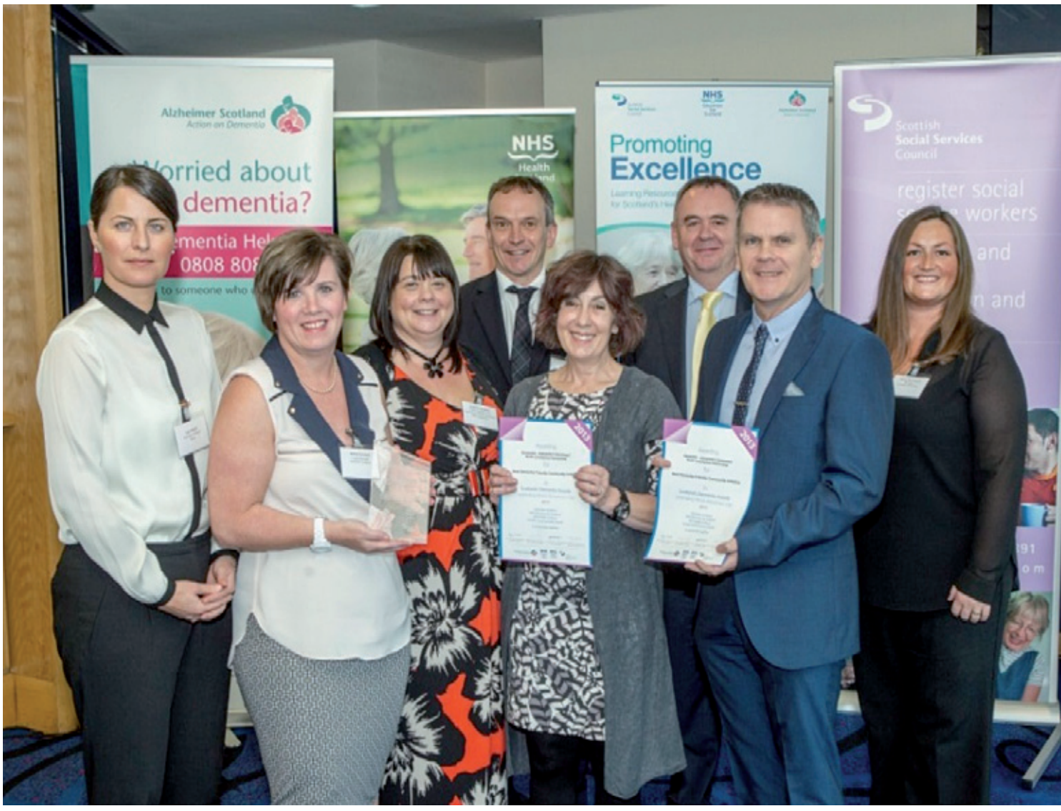
Collecting award at Scotland's Dementia Awards ceremony 2013