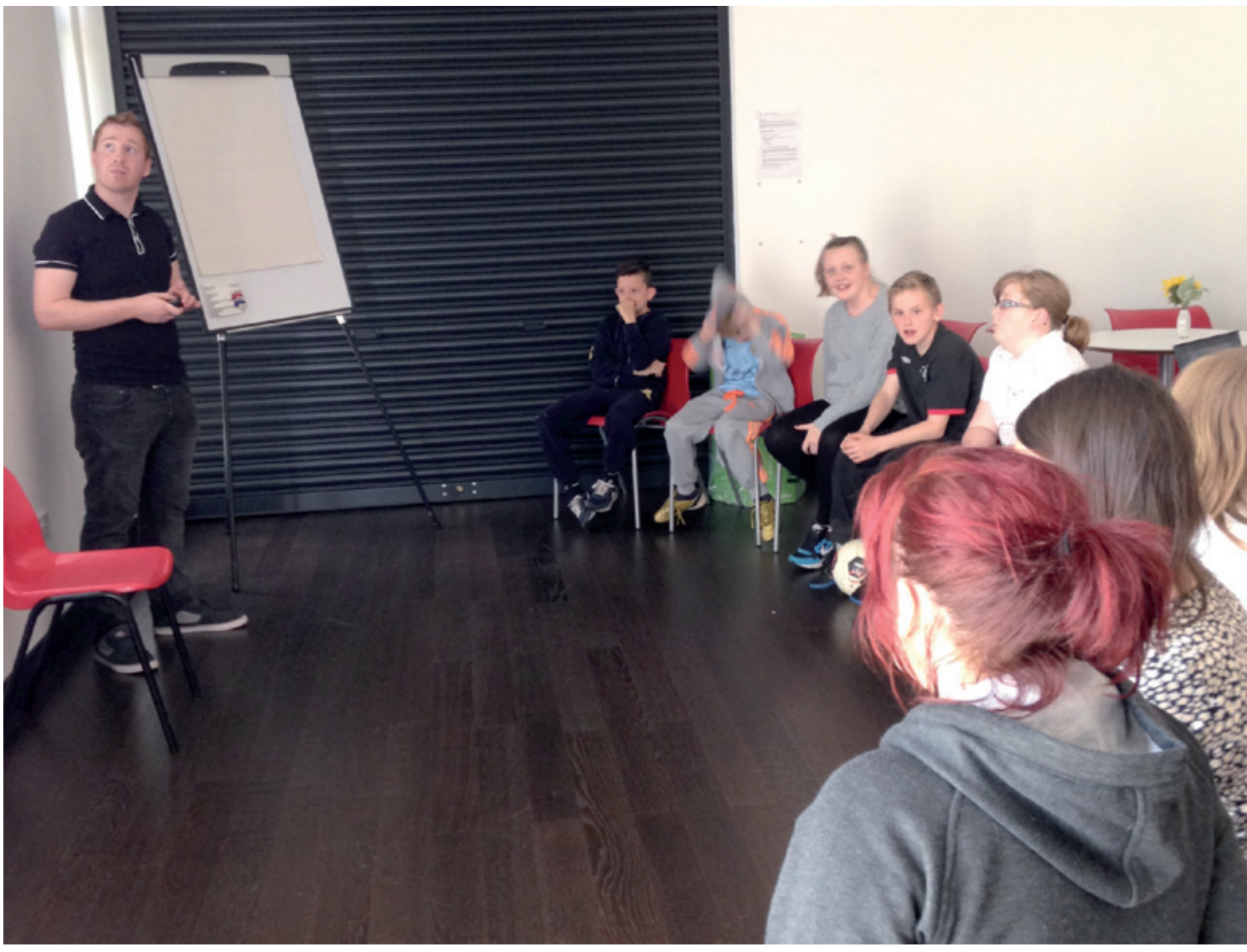
Awareness session at Centre Point Youth Group.