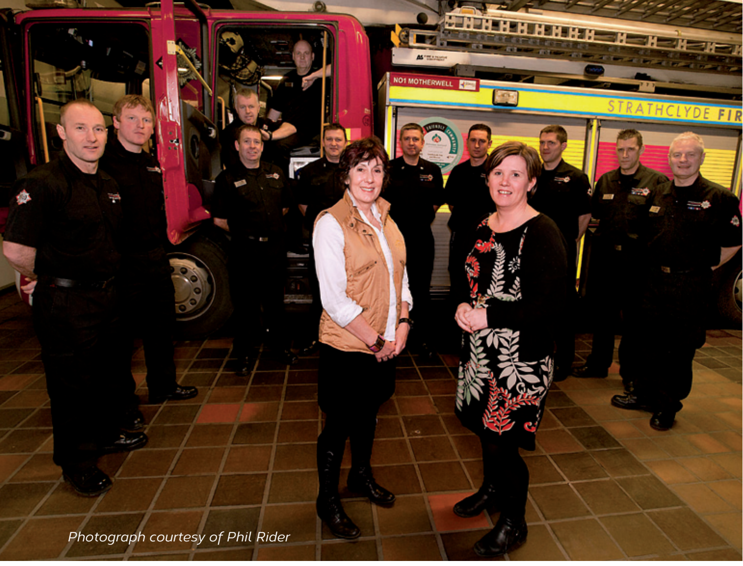
Scottish Fire and Rescue, Motherwell Station

Think about engaging with services that support people to feel safe and secure in their communities such as Scottish Fire and Rescue Service and Police Scotland. They are already engaging with this work in other areas of Scotland.