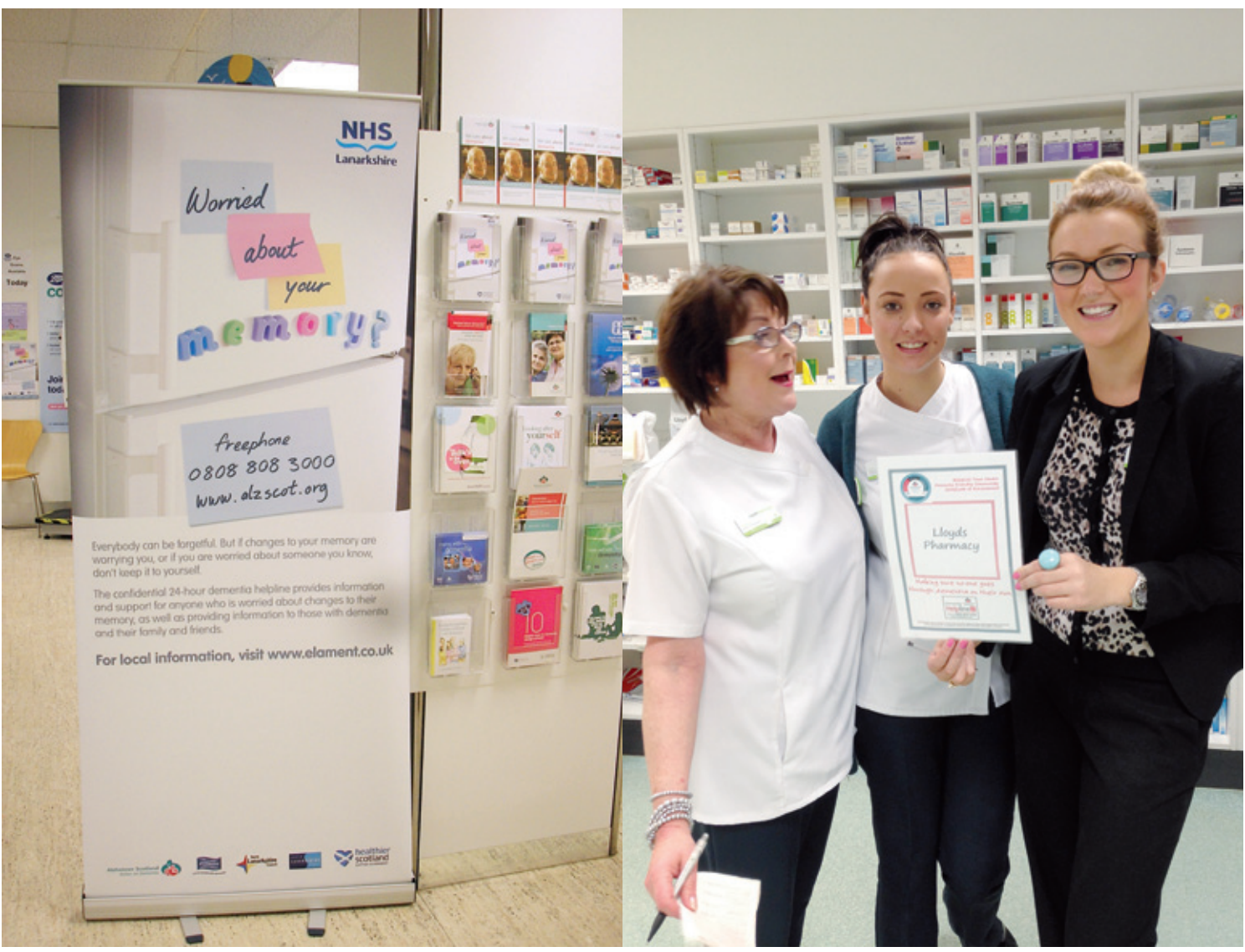
Local Boots and Lloyds pharmacies were among the first to support the initiative

We also wanted to use a brand that would have longevity and meaning outside of Motherwell as we would be sharing our work nationally as one of the three Dementia Demonstrator Sites.