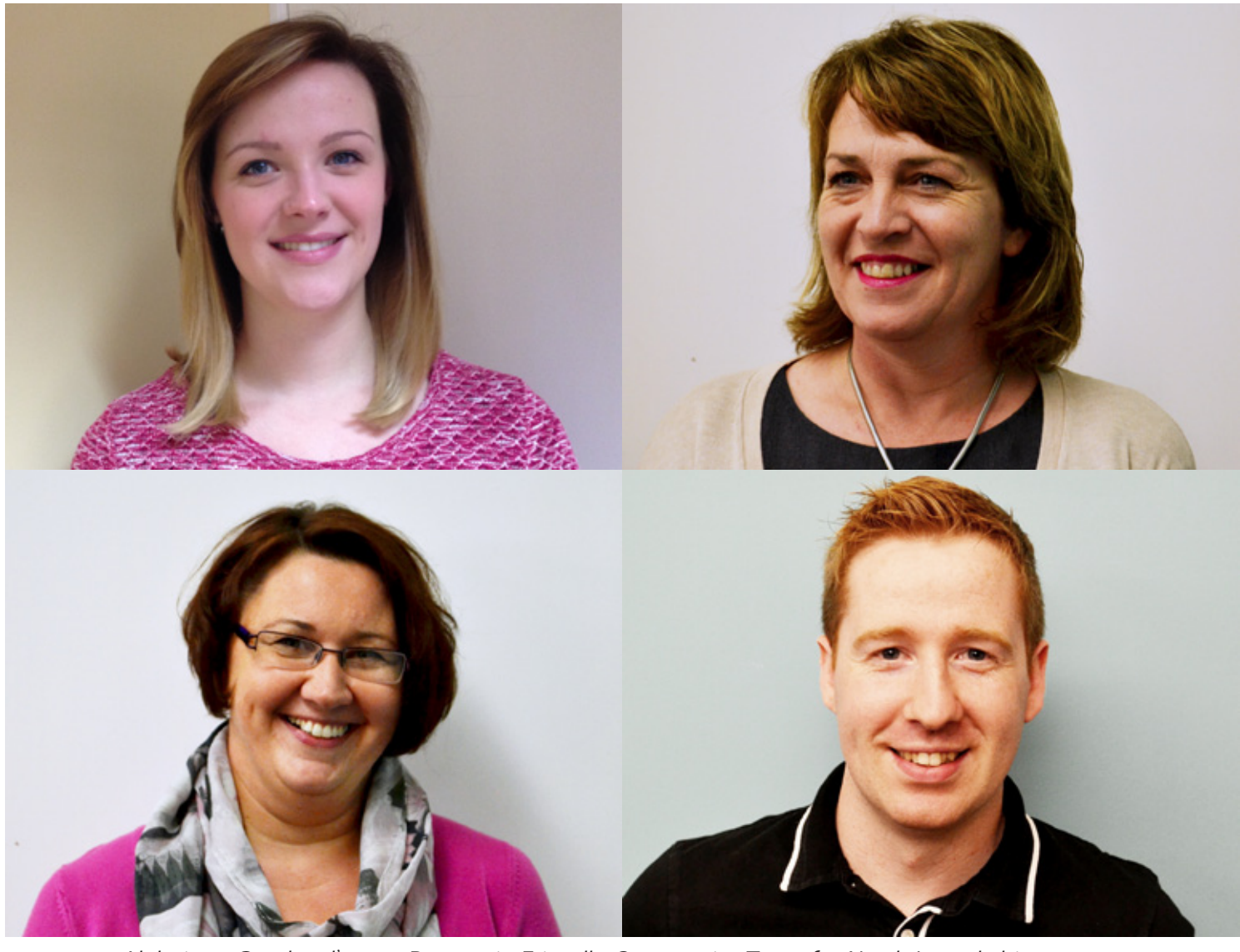
Alzheimer Scotland's new Dementia Friendly Community Team for North Lanarkshire