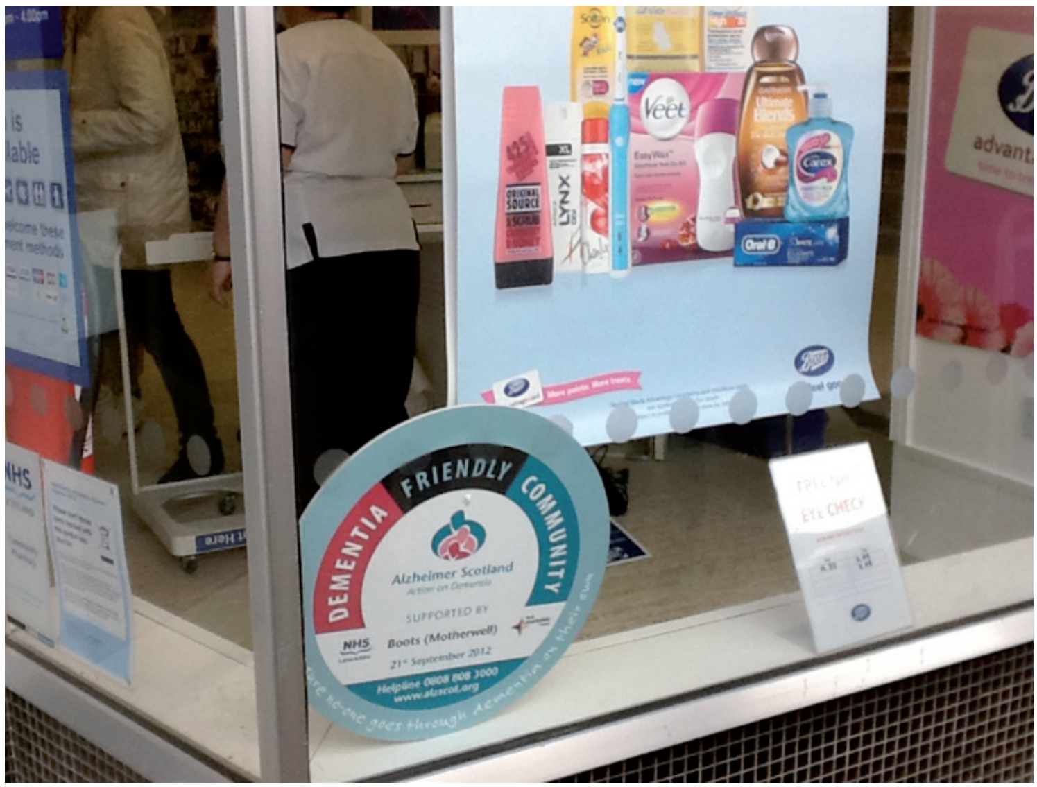
DFC logo in window of Boots, Motherwell

In delivering the programme, the pilot team created a simple methodology and tool kit. The tool kit would take the staff from the shops and businesses and the team through measured development stages towards 'dementia friendly community' status. This tool kit was refined through practical use and incorporates the following key components: