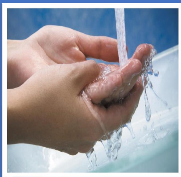
Now rinse of those bubbles

Now, dry your hands with a paper towel and put it in the bin.