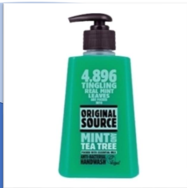
Time to use that soap you love